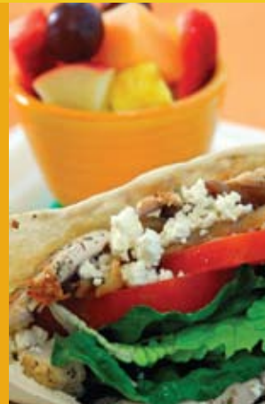
greek chicken pita

EGG SALAD lettuce, tomato, mayo, 7 grain